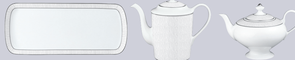
Plat à cake 37 cm Rectangular cake platter 15" Cafetière (1 L) Coffee pot (34 oz) Théière (75 cl) Tea pot (25.5 oz)