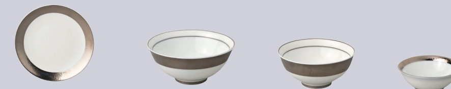
Assiette coupe 16 cm Coupe bread & butter plate 6 1/2" Bol à riz 12 cm (20 cl) Rice bowl 5" (6.8 oz) Bol à soupe 11 cm (14 cl) Soup bowl 4 1/2" (4.5 oz) Coupelle à soja 7 cm Soja sauce dish 2 1/2"

REF 6189 13 17 5771 147 169 127 53 125 133 2553-1 1302-1 1316-1 1303-1