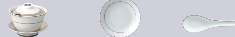
PT couverte (10 cl) Covered cup (3.5 oz) Coupelle 13 cm Fruit saucer 5" Cuillère chinoise 14 cm Chinese spoon 5 1/2"

REF 19 3 23 26 95 34 183 1305-1 55 1307-1