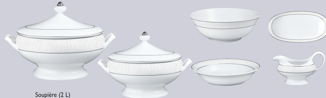
Soupière (2 L) Soup tureen (68 oz) Légumier (1 L) Covered vegetable dish (34 oz) Saladier 25 cm (1,7 L) Salad bowl 10" (57 oz) Compotier creux 24 cm Open vegetable dish 9 1/2" Ravier 23 x 12 cm Relish dish 9"x5" Saucière (25 cl) Gravy boat (8.5 oz)