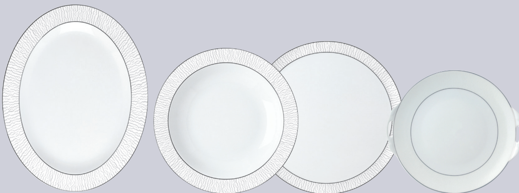
Plat ovale 38 cm et 33 cm Oval platter 15" and 13" Plat rond creux 29 cm Deep round dish 11 1/2" Plat à tarte 32 cm Round tart platter 13" Plat à gâteaux 27 cm Cake plate with handles 11"

REF 19 3 23 26 95 34 183 1305-1 55 1307-1