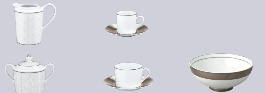
Crémier (30 cl) Creamer (10 oz) Paire tasse café (8 cl) A.D. cup & saucer (3 oz) Paire tasse thé (15 cl) Tea cup & saucer (5 oz) Bol D. 17 cm H. 7 cm 65 cl Medium bowl D. 7" H. 3" 22 oz